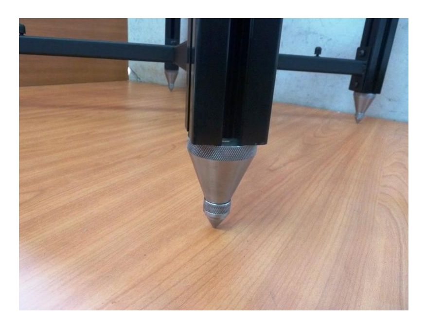
Read more about spiking and isolation here

The primary function of spiking is to focus the weight of the rack onto an infinitely small surface area, thus allowing it to function as a diode and transmit vibrations and energy only in one direction-rack to the floor. We have various kings of footers on offer however we generally use only the isosphere footer or the SureSpike both of which are CNC machined marine grade SS components. Spike feet to protect your floor are also available