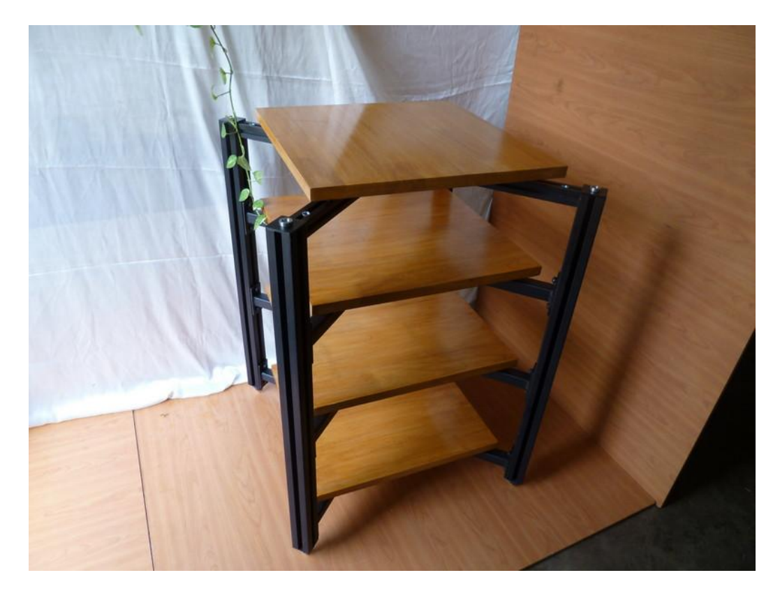
Theta Rack "Signature Series"